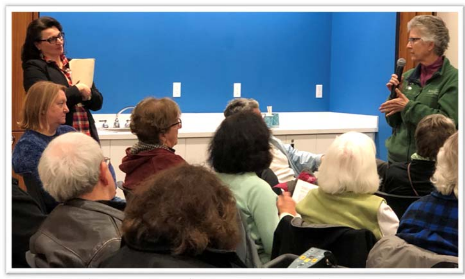
Speakers at the first Becoming American Event

Contrasting earlier immigration, this period saw a huge influx of people from southern and eastern Europe. Immigrants tripled the