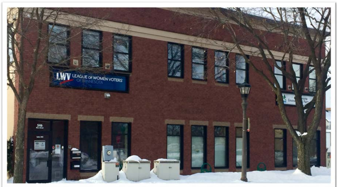
Image of the new LWVMN headquarters