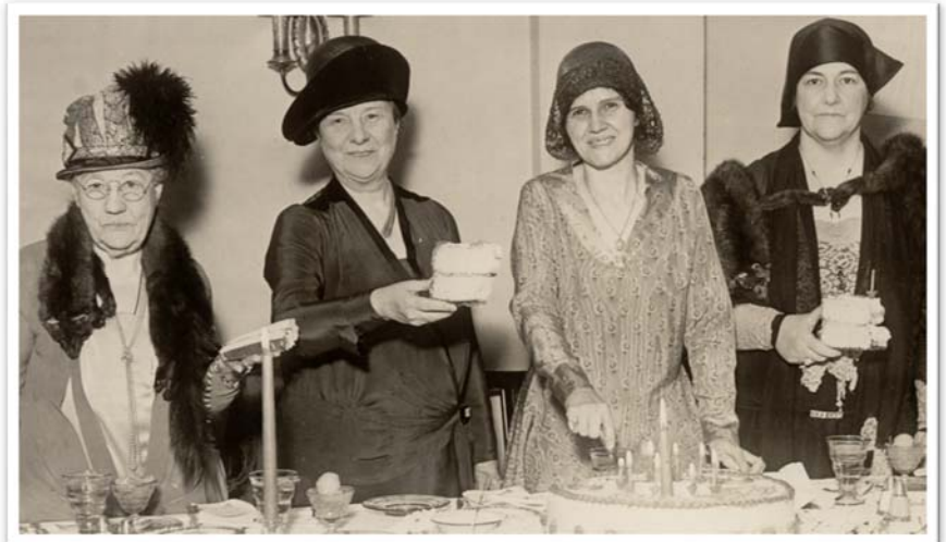
Celebrating the 10th Anniversary of Women's Suffrage

The remaining future LWV of Roseville Area events are detailed on page 11 .