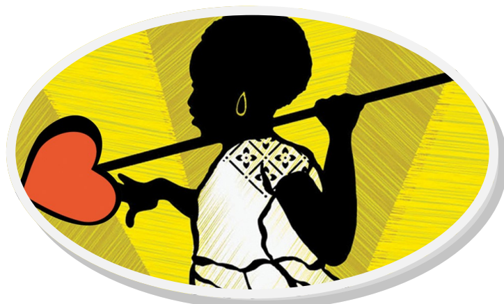
“Sunset Baby” is currently playing at the Penumbra Theatre.

www1.umn.edu/wishyouwerehere/artsandculture/theaterscene.html It is impossible to attend performances at all of them, so I am putting in a plug for this one. There are others that explore non-white topics, plays and playwrights, like Theater Mu and the Mixed Blood Theater, so a theatergoer need never be limited to the white writer classics. Try them all. Start small and then try more.